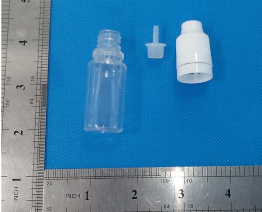
EUT Photo 3