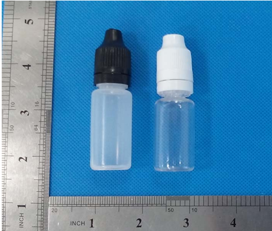
EUT Photo 2